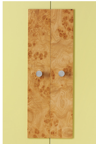
Accent Oak/Burr Oak