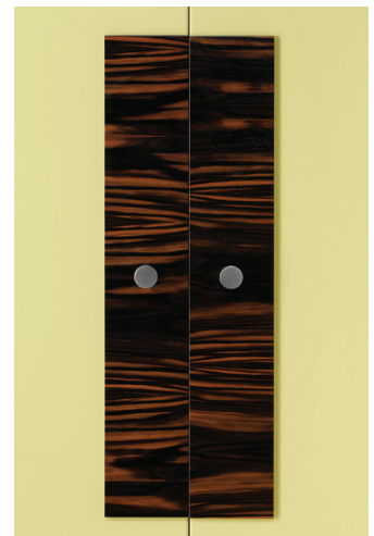
Accent Walnut/Ebony Macassar

Accent heights available – 300x100, 500x100, 700x100, 900x100. (See section 7.42 for model codes and pricing).