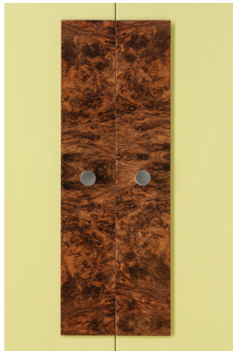
Accent Walnut/Burr Walnut