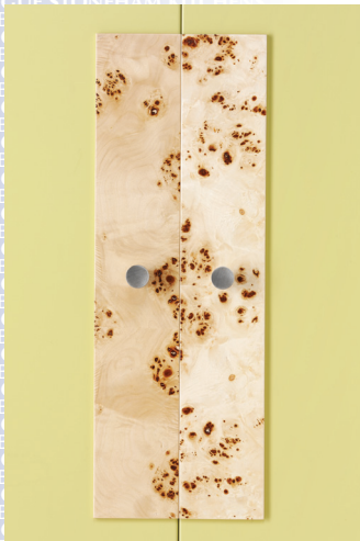
Accent Maple/Poplar Burr

Add design contrast to a plain door by design accent veneer inserts. Inserts can be located centrally, top or bottom corner of door (opposite to hinged side). 26mm solid timber with face veneer, rebated over door cut-out. Separate handle should be specified for fitment through the design accent inserts.